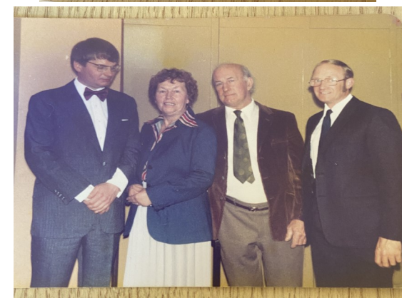
My husband in the Bow Tie and his Brother in Law after the Recital